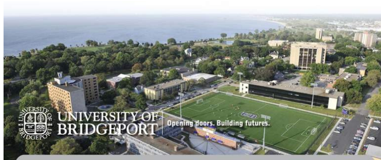
View point: The campus of University of Bridgeport