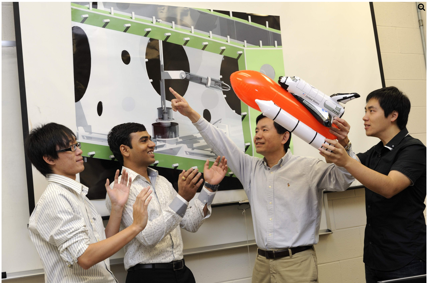
Students at University of Bridgeport